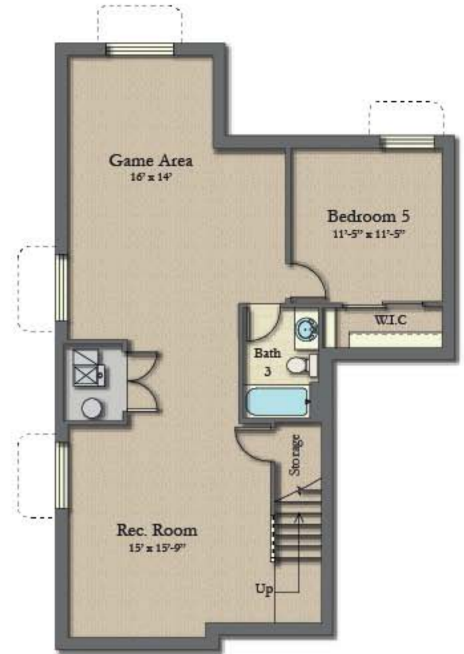
BASEMENT LEVEL 1,024 SQ.FT.