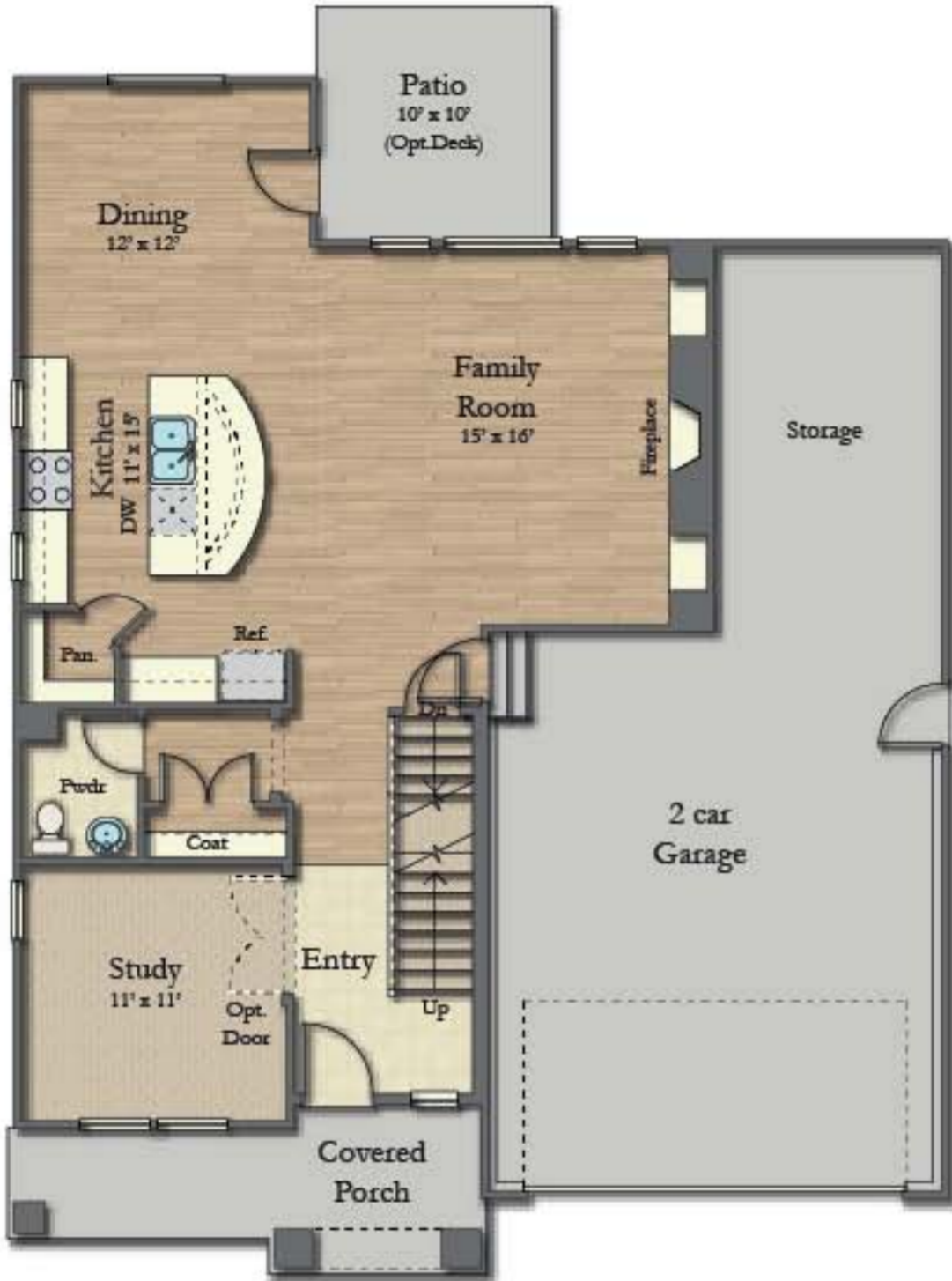
MAIN LEVEL 1,016 SQ.FT.