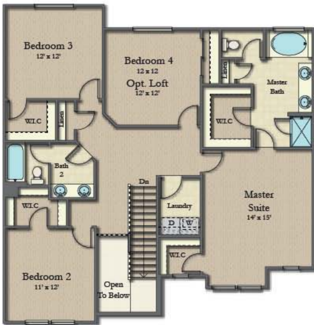
SECONDFLOOR 1,335 SQ.FT. FINISHED