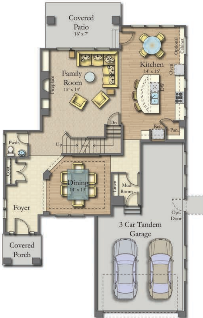
MAIN LEVEL 1,261 SQ.FT.