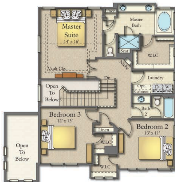
SECOND FLOOR 1,125 SQ.FT. FINISHED